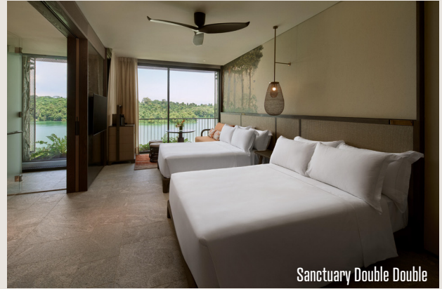
Sanctuary Double Double