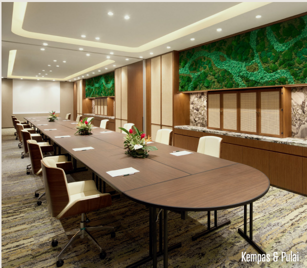
Kempas & Pulai