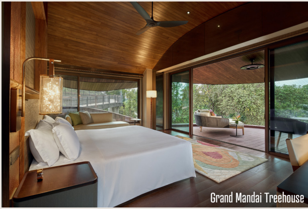
Grand Mandai Treehouse