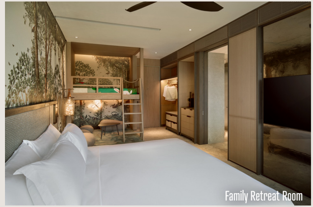
Family Retreat Room