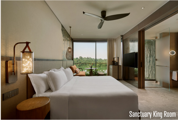
Sanctuary King Room